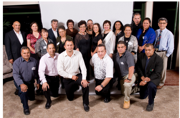
Tauranga Moana Representatives

There were key presenters on topics including the current economic climate and key investment opportunities. There was also strong networking capacity.